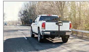
RD-M1 Module Road surface scanning