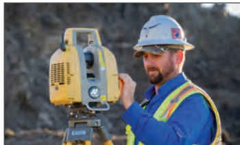
Scan Module for GLS-2000