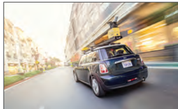
Mobile Module For IP-S scanner